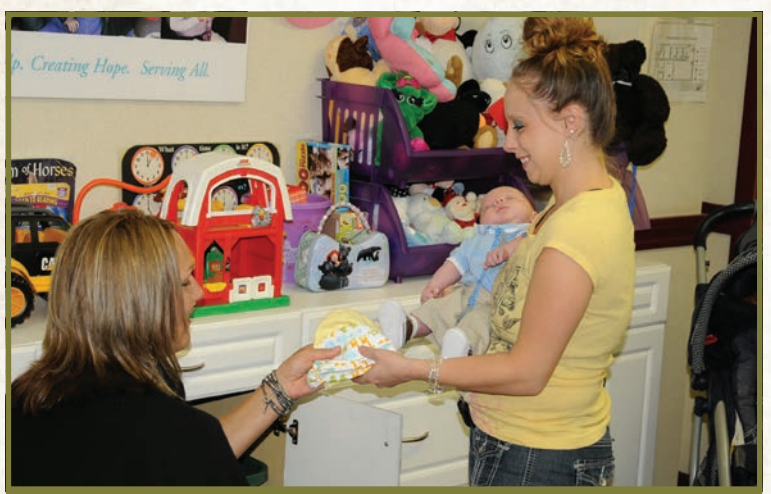
Last year, counseling time for Roselia Pregnancy and Parenting Support jumped 35 percent, with nearly one-thousand people receiving services.

As sacrificial gifts continue to be received, the non-profit volunteer board of Our Campaign for The Church Alive!, Inc. continues to put funds to work across the Diocese of Pittsburgh.